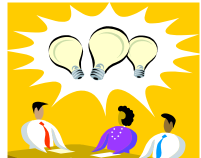
Saline County Commissioners Tuesday, Nov. 13, 12:15 to 1:30 p.m. Salina Public Library, Prescott Room (downstairs)

Please join in by attending with a mind full of questions to ask. We hope for a lively and productive interchange.